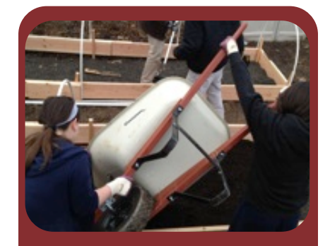
Pour and spread an even layer of gravel, approximately one inch thick.