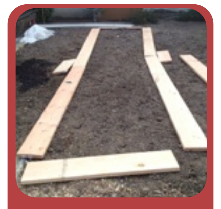
After picking a flat surface, lay out rot resistant lumber.

WHATIS A RAISED BED? A raised bed garden is a garden built on top of your native soil.