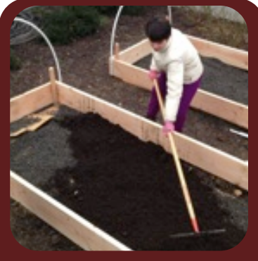
Fill the remaining space with compost.